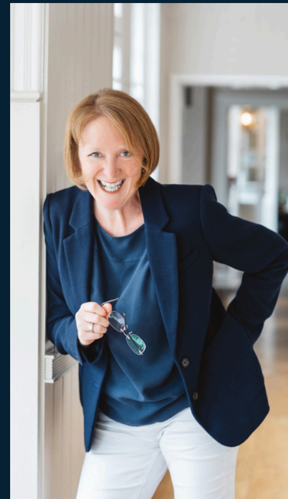
Founder & CEO